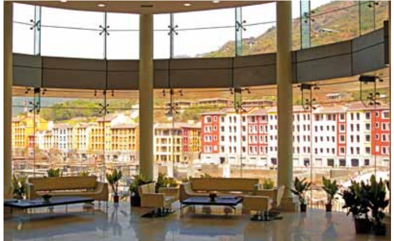
View of apartments being completed in Lavasa, from the lobby of LICC

According to both Fournier and McLeod India is a growing market in this field with lots of potential, in terms of welcoming, bidding for and hosting meetings and exhibitions. "You don't have the infrastructure yet, but from what I understand, it's coming... with all these upcoming resorts and convention centres it will work," emphasizes Fournier.